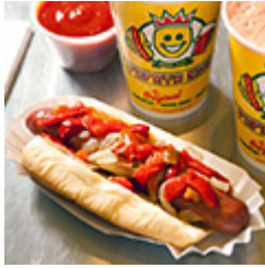
Table 1, Papaya King

411: Wolfgang Puck at Hotel Bel-Air , 701 Stone Canyon Rd, Malibu, 310-909-1644