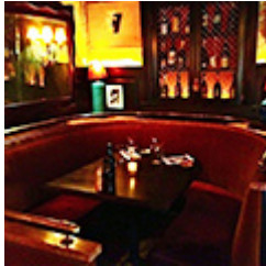
Table 401, Il Covo

You've got one month until you'll want to unveil a nice surprise for that special someone on February 14. (Even if you just met at 2am on February 13.) But you've got considerably less time to book one of these tables, because they're kind of the best in town.