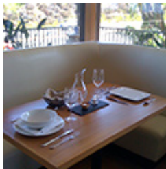
Table 17, Savory

411: Il Covo , 8700 W 3rd St, 310-858-0020